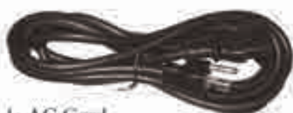
1: AC Cord