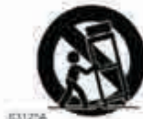
PORTABLE CART WARNING

Unplug this apparatus during lightning storms or when unused for long periods of time.